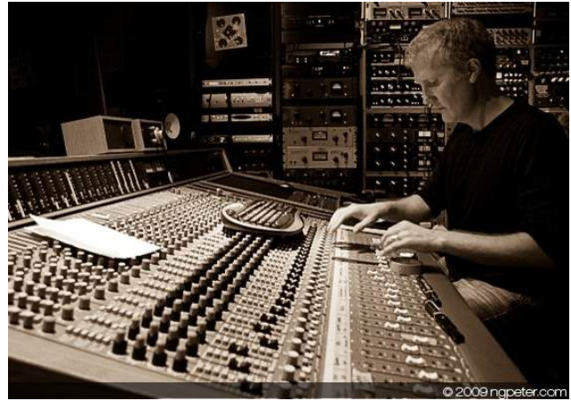
Mixing Sweet Mother Logic at Coup de Foudre Audio