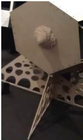
Installation, detail of Deep Listening Bathysphere